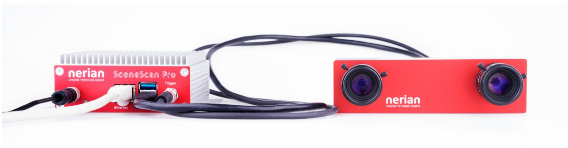
Figure 3: Karmin3 connected to SceneScan Pro.

The trigger signal must provide an appropriate trigger frequency that can be matched by the cameras and the selected SceneScan model. The possible frequencies for different system configurations are listed in Table 3. In low-light situations the desired frame rate might not be achieved if the sensor exposure time is too high. In these cases, an appropriate exposure time upper limit should be configured in the SceneScan settings.